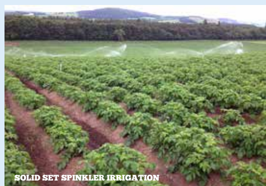
SOLID SET SPINKLER IRRIGATION

DRIP • SPRINKLERS • HARD HOSE • PUMPING SOLUTIONS FILTRATION • UV TREATMENT • K-LINE • BIO-FILTERS • BIO-BEDS