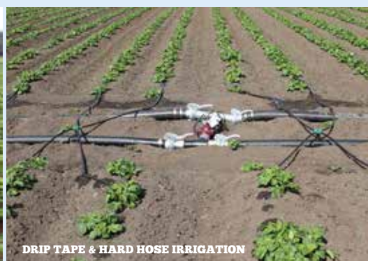
DRIP TAPE & HARD HOSE IRRIGATION